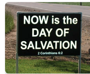
Reflective white letters on black