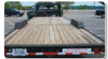
Bumper sticker with red letters on white vinyl.

Circle the color for each sign or fill in the blank.