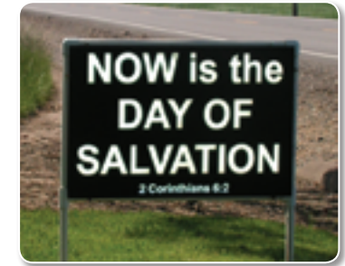
Reflective white letters on black